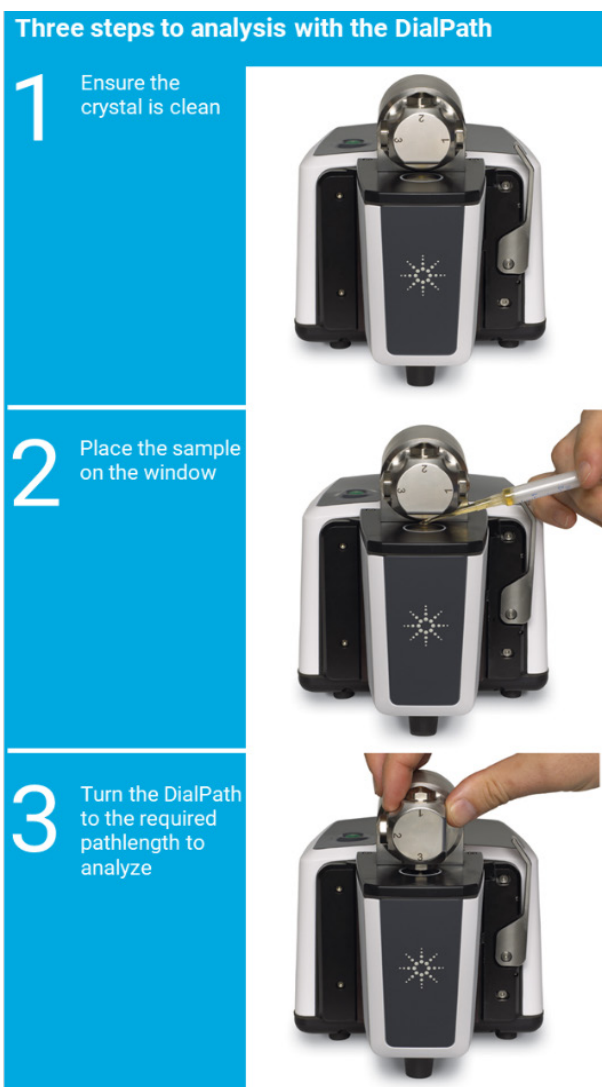
Figure 2. Liquid sample analysis. Three steps to analysis with the DialPath accessory.

Performing measurements on multiple peaks of varying intensity on the same sample can be performed easily simply by selecting the appropriate pathlength. The fixed and repeatable pathlength measurements enabled by the DialPath make it ideal for quantitative measurements.