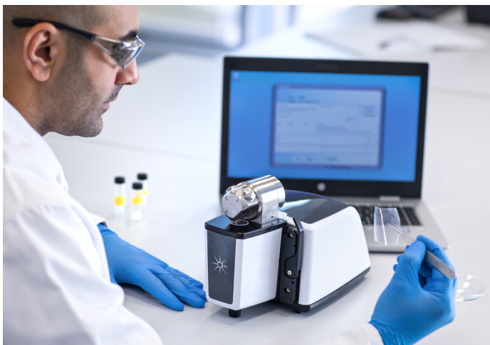
Figure 3. The DialPath accessory can be used to measure polymer films.