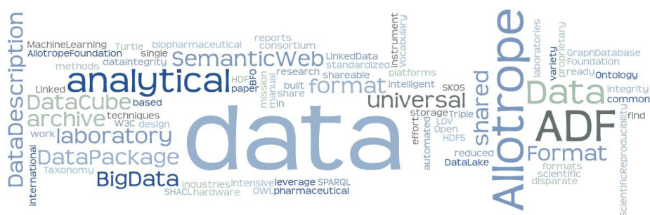
Figure 1. Word cloud: Allotrope Data Format.