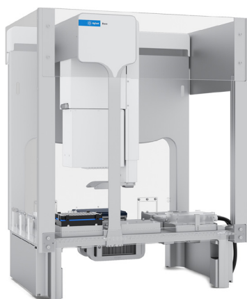
The Agilent Bravo has nine deck positions and can be configured with interchangeable 96-, or 384 disposable tip heads.