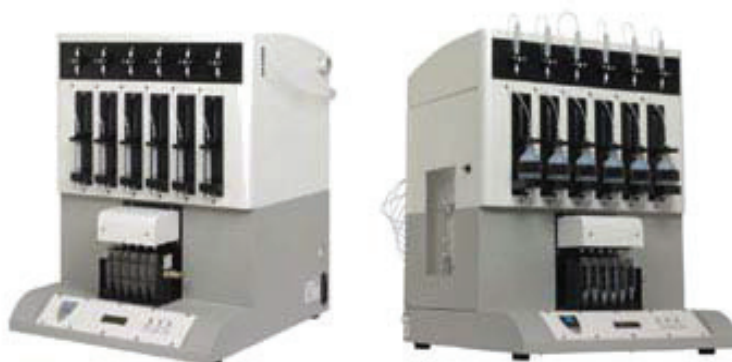
FIGURE 1. Dionex AutoTrace 280 SPE instrument cartridge system (left) and disk system (right).