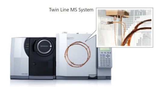
Fig. 1: GCMS-TQ8040 with Twin Line MS System