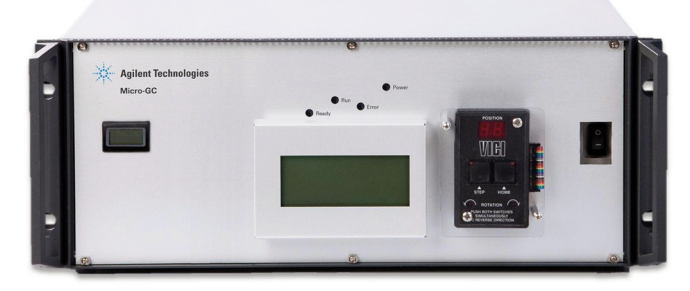
Figure 1. 19-inch rack mounted Agilent 490 Micro GC for smooth process integration.

The instrument's low consumption of power and operating gas both contribute to the low cost of operation. Miniaturization has resulted in small, shoe-box size, instrument dimensions that make it easy to integrate into mobile measuring cabinets or explosion proof enclosures. Optional, industry standard 19-inch rack configuration (Figure 1) further simplifies to incorporate the Agilent Micro GC into mud logging operations.