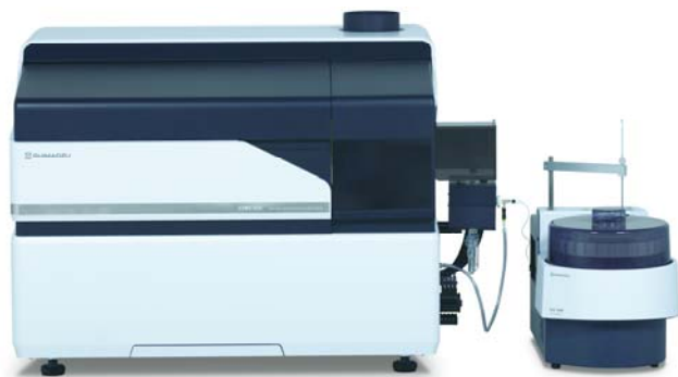
Figure 1. ICPMS-2030 Inductively coupled plasma mass spectrometer with AS-10

Measurements were made using an off axis collision cell system with helium gas which achieves superior sensitivity by providing molecular ion removal and high elemental ion transmission which in result reduces matrix interferences. The detailed instrument configuration and operating parameters are summarized in Table 4.