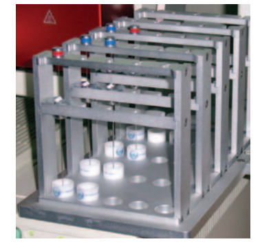
Figure 1c: 25-position tray

Moreover, the autosampler parameters used for all derivatization reagents (by sample tray rotation or magnetic stirrer) allowed completion of the analysis cycle by conditioning and sealing in the Teflon septum inserted into the tray.