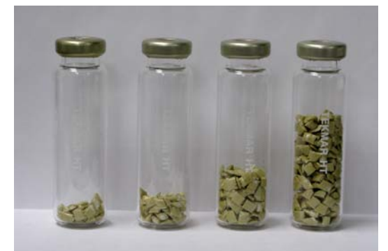
Figure 1 – Comparison of 1 g, 2g, 4g, and 8g of a HT Polymer Sample in 22 mL High Temperature Headspace Vials

A HT polymer was obtained as raw pellets. Four sample weights, 1 g, 2g, 4g, and 8g, were weighed into 22 mL headspace vials. These were capped and sealed with Teflon lined septa. The sample weight range will provide data to determine the linearity of the VOC and SVOC peaks observed in the sample. Figure 1 is a photo of the four sample size concentrations, indicating their volume in the 22 mL headspace vial.