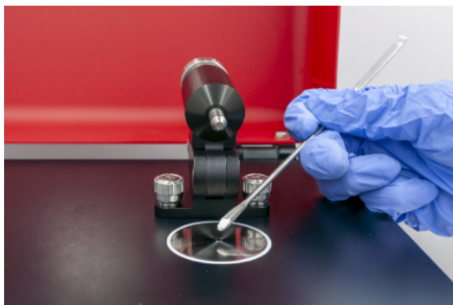
Figure 1. Diamond ATR sampling interface on the Agilent 4500a FTIR forensics analyzer.

For dedicated drug identification applications, the FTIR forensics analyzer package offers a comprehensive TICTAC FTIR spectral library of new psychoactive substances (NPS) and other drugs. The TICTAC ATR FTIR drugs library focuses on NPS but also includes traditional drugs of abuse and substances related to drugs and drug abuse, such as contaminants, adulterants, diluents, potentiators, precursors, and substances passed off as drugs.