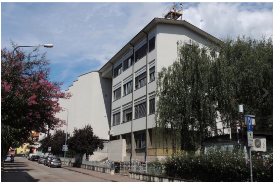
Provincial Palace in Via Amba Alagi 5, Bolzano.