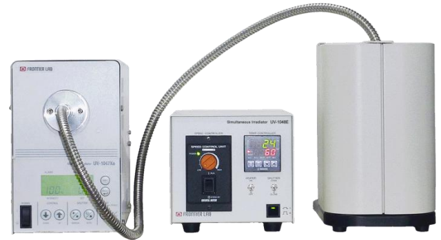
UV light source * (UV-1047Xe with Xe lamp)

Using UV/Py-GC/MS system, the irradiated polymer samples can be analyzed by EGA (Evolved Gas Analysis) or Py-GC/MS analysis.