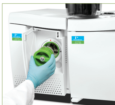
A simple twist and pull is all that is required to access the tool-free SMARTsource on the Clarus SQ 8 GC/MS.

PerkinElmer, Inc. 940 Winter Street Waltham, MA 02451 USA P: (800) 762-4000 or (+1) 203-925-4602 www.perkinelmer.com