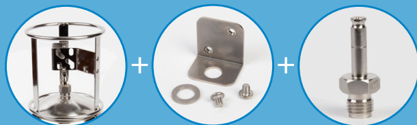
Bracket for Restek cans only.