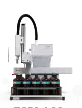
7650-L20 GC Gas Autosampler