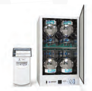
3108D Canister Cleaning System