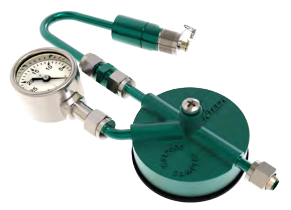
CS1200ES Silonite™ Coated Passive Canister Sampler