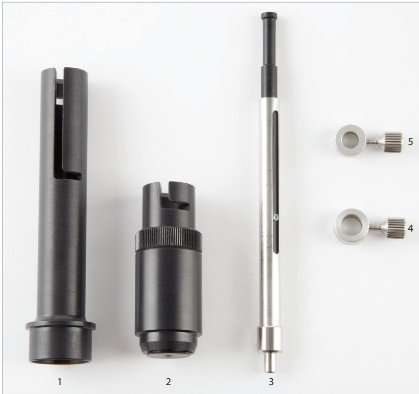
Figure 1: Parts Included in the Restek PAL SPME Manual Injection Kit