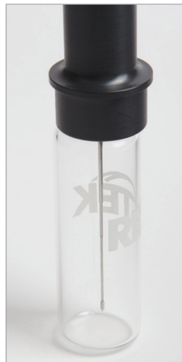
Figure 11: Exposure Depth for Immersion Extraction