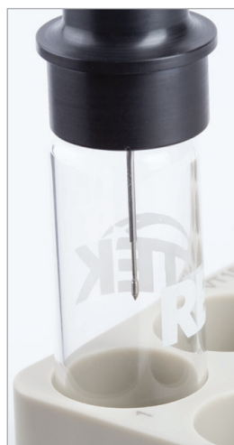
Figure 9: Exposure Depth for Headspace Extraction