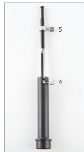
Figure 6: Syringe Installed in the Extraction Guide