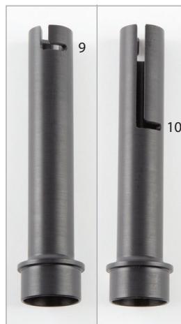
Figure 5: The extraction guide has two extraction positions (notches).