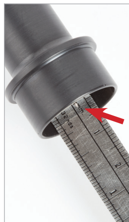
Figure 7: Proper Positioning of a SPME Arrow in the Extraction Guide