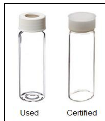
Figure 1: Glass containers tested in this study

Shimadzu ASI-L auto sampler were also analysed (Figure 1). These used glass containers which have been used to store TC standard solutions, were cleaned by rinsing with ultrapure water several times.