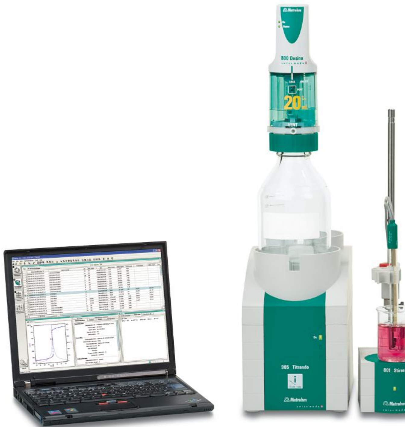
Figure 1. 905 Titrando with tiemo. Example setup for the determination of vitamin C.

This bivalentametric analysis is carried out on a 905 Titrando system equipped with a magnetic stirrer and a double Pt sheet electrode for indication.