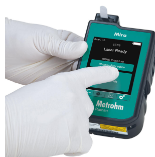
Figure 1. SERS is easily implemented on any 785 nm Raman instrument with dedicated substrates. Metrohm's MIRA XTR and P-SERS substrates are a convenient, portable, and sensitive solution.

Methyl mercaptan (MM; 2,000 mg/L in toluene) was serially diluted with paraffin oil. Dilute samples (5 \mu\text{L} ) were applied to Metrohm's silver paper SERS (Ag P-SERS) substrates and allowed to rest for five minutes. After resting, SERS data was collected with MIRA XTR (Figure 1). Experiment samples and conditions are summarized in Table 1.