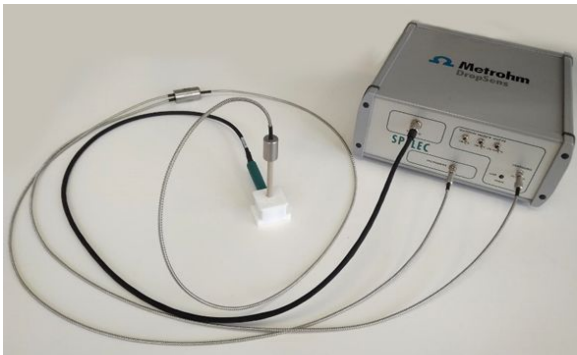
Figure 1. Setup for UV/VIS spectroelectrochemistry.

Spectroelectrochemical monitoring was performed using SPELEC, a fully-integrated instrument for UV/VIS spectroelectrochemistry. This instrument integrates in a unique box the electrochemical (bipotentiostat/galvanostat) and the spectroscopic equipment (light source and detector). SPELEC was used in combination with a bifurcated reflection probe (RPROBE-VIS-UV) ( Figure 1 ). This instrument is controlled by Dropview SPELEC, a dedicated software that allows performing real-time spectroelectrochemical measurements and provides completely synchronized electrochemical and optical data.