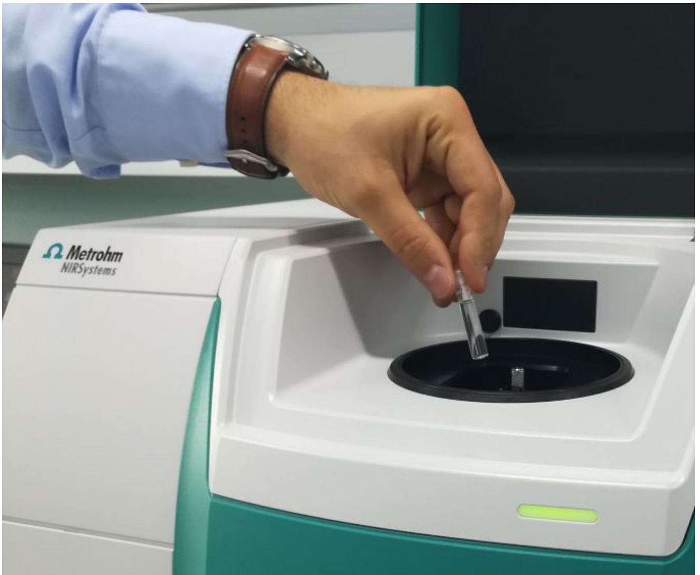
Figure 1. DS2500 Liquid Analyzer and a sample filled in a disposable vial.

17 samples of three different CBD carrier oils (hemp, fish, and MCT (medium-chain triglycerides) oil) were measured in transmission mode with a DS2500 Liquid Analyzer. The built-in temperature control was set to 40 °C to acquire reproducible spectra. For convenience, disposable vials with a path length of 8 mm were used, which made cleaning of the sample vessels unnecessary. The Metrohm software package Vision Air Complete was used for all data acquisition and prediction model development.