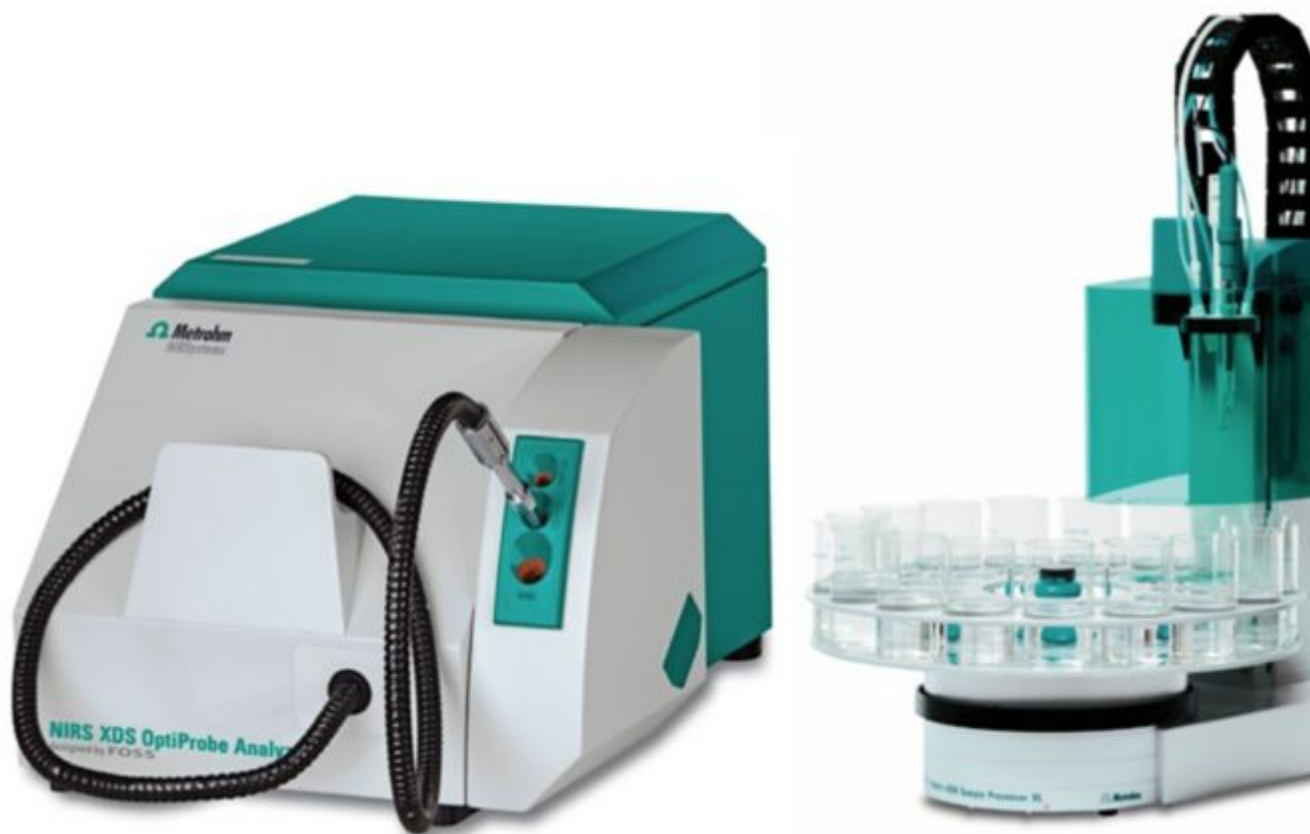
Figure 1. The NIRS XDS OptiProbe Analyzer and the 815 Robotic Sample Processor.

17 spectra of samples with varying moisture content were collected using a Metrohm NIRS XDS OptiProbe Analyzer in combination with the 815 Robotic Sample Processor. With the attached large sample rack, it was possible to automate measurements of up to 62 samples in series. The reference values were obtained by KF-titration. The data set consisting of spectra and lab values was split into a calibration set (11 samples) and validation set (6 samples). Outlier detection was performed on pre-treated spectra ( 2^{\text{nd}} derivative) using a maximum distance in wavelength space algorithm.