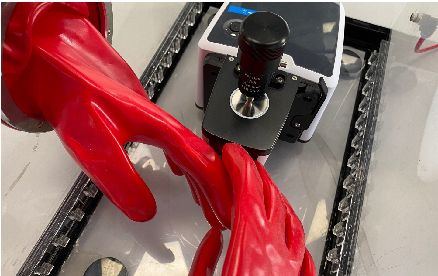
Figure 1. The Cary 630 FTIR spectrometer with its ultracompact, lightweight design (20 x 20 cm and 3.6 kg) can be easily handled and positioned relative to the sample, ensuring high-quality results.

In this study, the Agilent Cary 630 FTIR spectrometer fitted with a diamond ATR module (Figure 1) was used to qualify commonly used LIB-electrolyte solvents. The note describes the creation of a reference spectral library using the Agilent MicroLab software and the application of a method-based approach to confirm the identity of various electrolyte solvents.