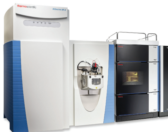
Q Exactive HF-X mass spectrometer with H-ESI II ion source and Thermo Scientific™ Vanquish™ UHPLC System