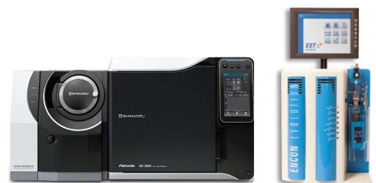
Fig 1. Shimadzu GCMS-QP2020 NX and EST Econ Evolution Purge and Trap Concentrator.

In the study, an EST Analytical Econ Evolution purge and trap concentrator and Centurion WS autosampler were interfaced to the Shimadzu GCMS-QP2020 NX (Figure 1). The experimental parameters for both GC-MS and P&T systems are listed in Table 1.