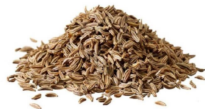
Figure 1. Cumin seeds

Cumin ( Cuminum cyminum ) has been used as a natural medicine for over 2000 years. It shows anti-inflammatory property and supports the immune system. Cumin seeds (Figure 1) have been widely used as a spice in many food preparations. In order to fulfil the high-demand of such spices, pesticides are widely used. But their overuse may cause acute and permanent health problems in humans. Therefore, to protect human health, the European Union has set maximum residue limits (MRLs) for the presence of insecticides in cumin seeds [1] . Thus, increasing the importance of having analytical method for determination of residual pesticides present in cumin seeds.