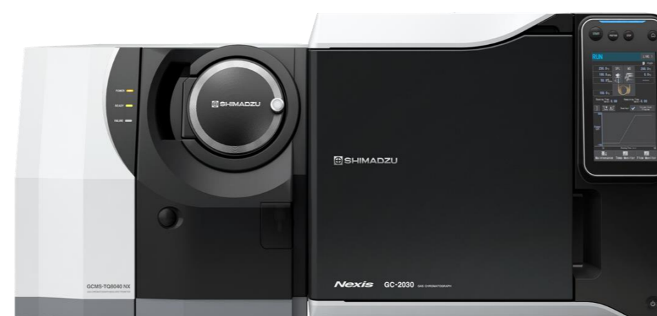
Figure 2. Shimadzu GCMS-TQ8040 NX

In order to determine the extraction efficiency of the method, recovery study was conducted. For this, 2 g sample was spiked with pesticide standard mixture to prepare recovery samples of 10 ppb and 20 ppb. The spiked pesticides were then extracted, analyzed and quantified against matrix matched linearity to study their recoveries.