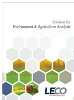
Environment & Agriculture 209-205-005