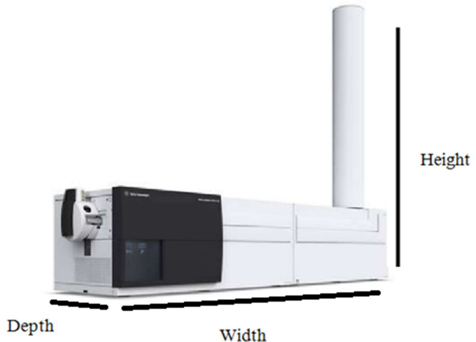
Figure 3 G6560 Ion Mobility Q-TOF LC/MS System