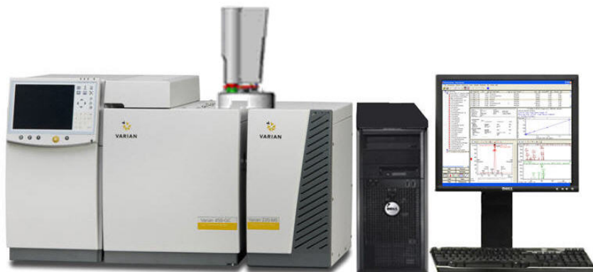
Figure 2 Layout for the GC/MS with the 450-GC

In Figure 2, the 450-GC is to the left of the MS to allow the transfer line to connect from the GC to the GC/MS. The bench must be long enough and strong enough to support the weight of the system and any additional equipment see Table 3, and Table 4. The bench must be at least 84 cm (33 in.) deep.