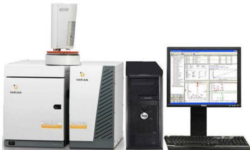
Figure 1 Layout of the GC/MS with the 431-GC

In Figure 1, the 431-GC is to the left of the MS to allow the transfer line to connect from the GC to the GC/MS. The bench must be long enough and strong enough to support the weight of the system and any additional equipment see Table 1, and Table 2. The bench must be at least 84 cm (33 in.) deep.