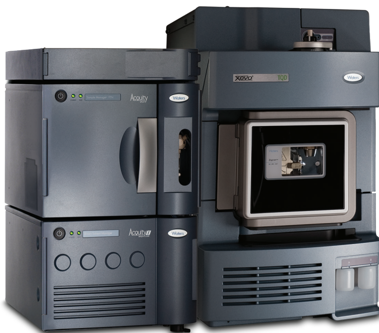
Figure 1. The ACQUITY UPLC I-Class System and Xevo TQD Mass Spectrometer.

Here we describe a clinical research method using protein precipitation of whole blood with internal standards. Chromatographic elution was completed within 1.8 minutes using a Waters ACQUITY UPLC HSS C 18 SB Column on a Waters ACQUITY UPLC I-Class System followed by detection on a Xevo TQD Mass Spectrometer (Figure 1).