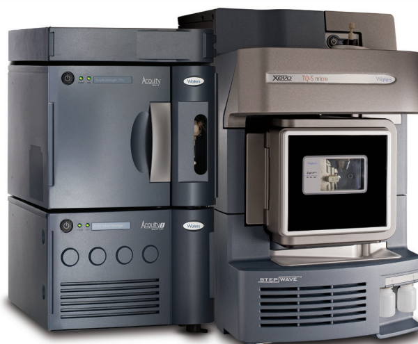
Figure 1. ACQUITY UPLC I-Class and Xevo TQ-S micro configuration.

A simple, sensitive UPLC-MS/MS method for targeted forensic toxicology screening of compounds in various biological matrices.