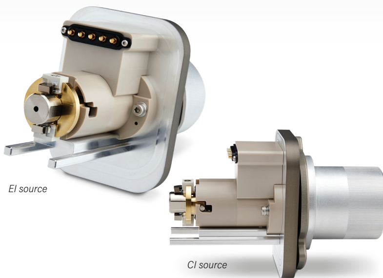
Figure 1. The Xevo TQ-GC is designed for simple, tool-free changeover between Electron ionization (EI) and Chemical ionization (CI) in less than 10 minutes.

In traditional GC-MS/MS analysis, the technique that is most often utilized is electron ionization (EI). However in some cases, compounds can be labile and fragment heavily when using EI, which can make it difficult to identify them via NIST library searches, or to generate selective MRMs. Chemical ionization (CI) operated in both positive and negative ion modes can help reduce the fragmentation significantly. By utilizing the dedicated CI ionization source available on Waters™ Xevo TQ-GC, which was designed for extended robustness and rapid tool-free changeover, both EI and CI experiments can be performed on the same system.