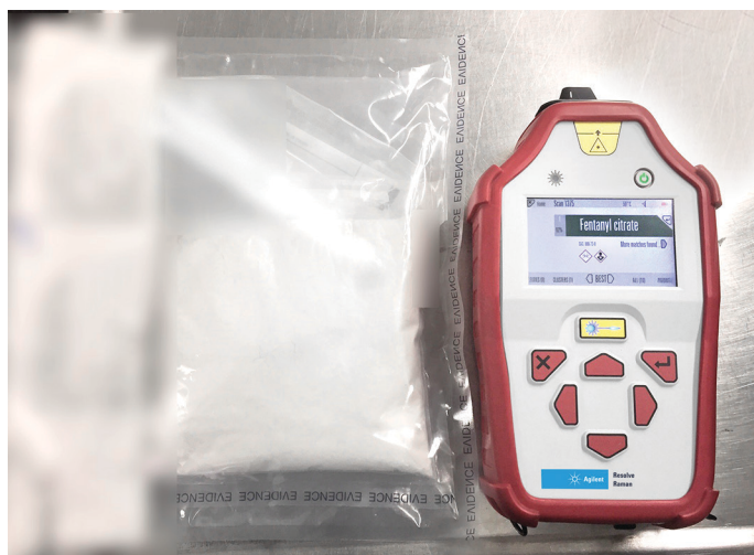
Figure 3. Scan of fentanyl through multiple plastic layers.