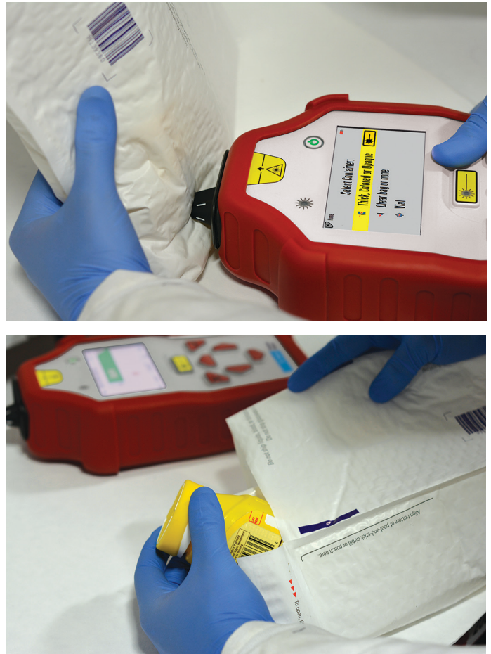
Figure 1. The Agilent Resolve system has the unique capability to scan through multiple opaque layers of packaging without any prior knowledge of the sample. This example consists of pills contained within opaque plastic and mailer bag.

The Agilent Resolve system allows operators to examine a maximum range of packages or containers for indications of fentanyl or NPSs before disturbing, opening, or taking a sample. This practice reduces the risk of exposure, and enables more efficient decision making and processes (Figure 1).