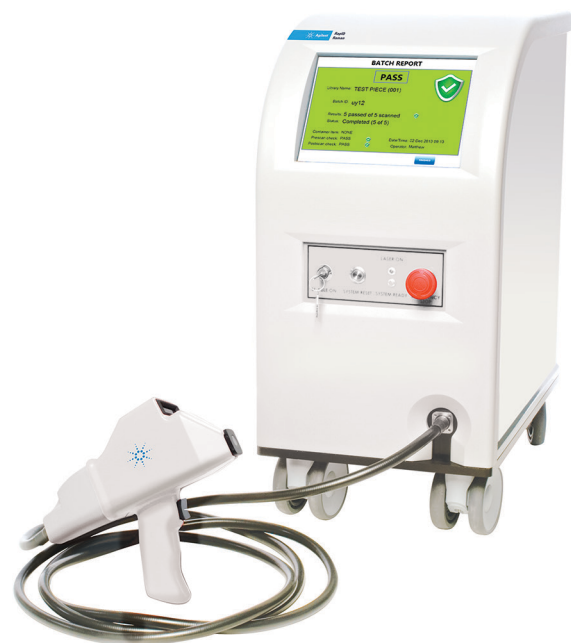
Agilent RapID Raman system.

Preventing contamination is particularly important in injectable and intravenous product manufacture as the costs of downtime and lost production can be significant. By using Agilent spatially offset Raman spectroscopy (SORS) 1 technology the container can remain closed and still verify the content's identity reliably.