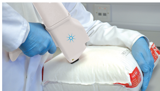
Figure 2. Verification through a nontransparent plastic sack.

Salts are often used in injectable products. Monatomic ionic compounds do not have a Raman spectrum unless they are chemically bound with water, so sodium chloride (NaCl) cannot be detected by conventional Raman spectroscopy. However, magnesium chloride hexahydrate ( \text{MgCl}_2 \cdot 6\text{H}_2\text{O} ) and calcium chloride dihydrate ( \text{CaCl}_2 \cdot 2\text{H}_2\text{O} ) can be identified through unopened paper and plastic sacks. Generally, solids can be measured through plastic/paper sacks (for example, citric acid) and HDPE bottles (for example, sodium acetate trihydrate), as shown in Figure 1C.