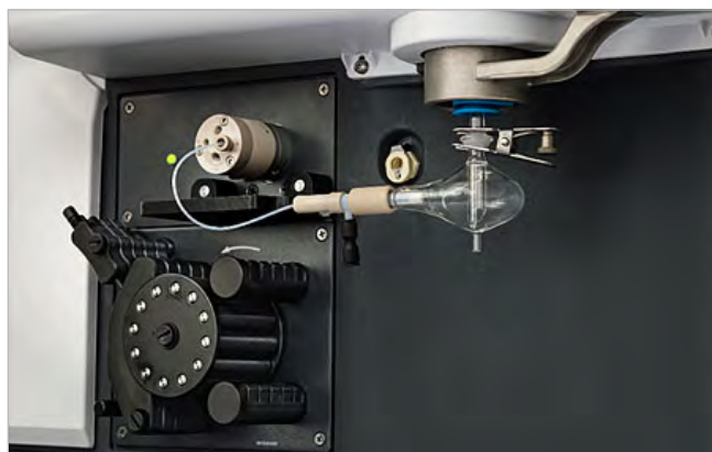
Figure 1. Agilent 4210 MP-AES with Agilent Advanced Valve System (AVS 4) four port switching valve

and ease-of-use. The valve quickly switches between rinse and sample. This minimizes exposure of sample introduction components to high matrix samples, prolonging the lifetime of consumable items.