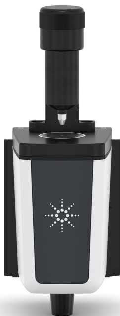
Figure 4. Zinc selenide ATR module for the Agilent Cary 630 FTIR spectrometer.

Because of the relatively short pathlength of infrared light into the sample, this sensor is ideal for neat samples; that is, samples that are relatively concentrated or pure. The single reflection ZnSe module is a good choice for identification of softer materials, as well as viscous liquids. When measuring solids, such as polymer films, it can be used with the Cary 630 FTIR. The ZnSe ATR module is depicted in Figure 4.