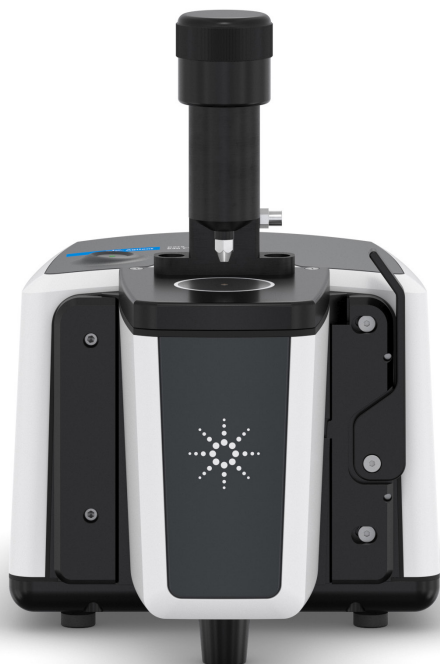
Figure 6. Single reflection diamond ATR module for the Agilent Cary 630 FTIR spectrometer.

The use of diamond as an ATR material has revolutionized FTIR sampling. Harder samples, such as minerals and harder polymers, can be readily analyzed with this sensor because it cannot be scratched. The diamond ATR is also resistant to strong acids and bases, and is excellent for measuring high- or low-pH aqueous solutions. The diamond ATR for the Cary 630 FTIR is a single reflection sensor used with the sample press to enable good contact between the material to be analyzed and the diamond surface. As a single reflection sensor, it is ideal for neat or pure substances that are particulates, powders, or other hard materials. The unique design of the diamond ATR for the Cary 630 FTIR results in high-energy throughput, and the combination of the spectrometer and diamond sampling technology typically outperforms other routine FTIR systems. The single reflection diamond ATR module is depicted in Figure 6.