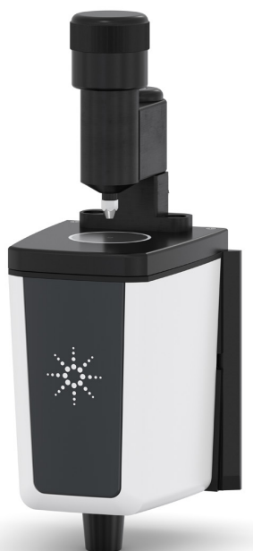
Figure 7. Single reflection germanium ATR module for the Agilent Cary 630 FTIR spectrometer.

Ge is a brittle, hard, semimetallic element with a high index of refraction, which yields a shorter depth of penetration for infrared radiation. The Cary 630 FTIR uses a single reflection Ge ATR element, which is an excellent choice for analyzing materials that are highly absorbing, or have highly scattering components. Samples such as polymers containing carbon black are often analyzed with the Ge ATR. O-rings, gaskets, and black rubber tires are all examples of materials that are well suited to analysis by the Cary 630 FTIR Ge ATR sampling module. The single reflection germanium ATR module is depicted in Figure 7.