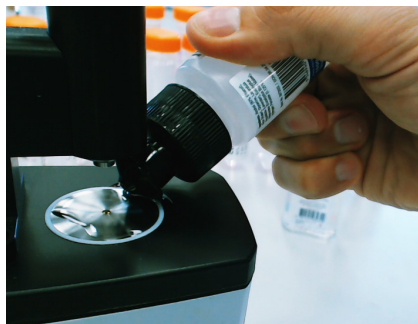
Figure 9. The neat hand sanitizer sample is placed onto the ATR accessory, fitted to the Agilent Cary 630 FTIR. The Agilent MicroLab software uses picture-guided workflows to help users follow each step of the measurement including cleaning and sampling.

A Cary 630 FTIR with the diamond ATR module was used to quantify the alcohol content in hand sanitizers. The MicroLab software was used to develop a routine quality control (QC) method that automatically identified the type of alcohol, and accurately determined the alcohol concentration.