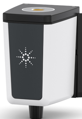
Figure 5. Multireflection zinc selenide ATR accessory for the Agilent Cary 630 FTIR spectrometer.

The exceptional performance of the Cary 630 FTIR, combined with the increased pathlength of the multireflection ATR sensor, demonstrates a spectrometer system of unsurpassed sensitivity. Lower concentration components in pastes, gels and liquids can be measured. Solutes in diluted or concentrated aqueous solutions in the pH range of 5 to 9 can also be analyzed. Since the multireflection sensor is recessed slightly in its stainless steel holder, it is ideal for analyzing nonviscous liquid samples. This sensor is a superior choice when qualitative or quantitative measurements are required. It is not recommended for use with solid materials, since it is not used with the pressure clamp. The multireflection ZnSe ATR module is depicted in Figure 5.