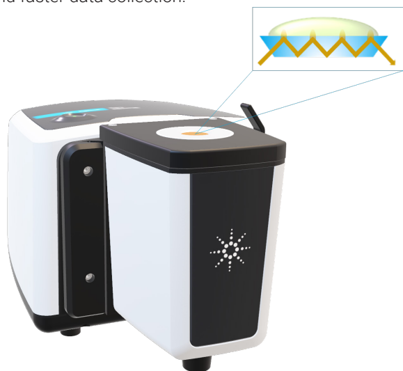
Figure 3. Multireflection ATR accessory for the Agilent Cary 630 FTIR spectrometer.

In contrast, multireflection ATR sensors use a longer crystal, which allows the light beam to be totally reflected off the sample surface multiple times before detection (Figure 3). As a result, the IR light interacts with the sample at each of the reflection spots, providing a longer effective pathlength. This increases the sensitivity of the measurement, ideal for challenging applications that require a lower limit of detection and faster data collection.