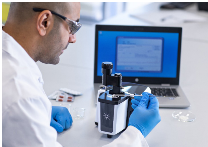
Figure 1. The Agilent Cary 630 FTIR spectrometer can be equipped with the right sampling modules to cover all analytical needs. The diamond ATR sampling module is ideal for the FTIR analysis of solids, liquids, gels, and powders.

This technical overview reviews the ATR sensors available for the Cary 630 FTIR spectrometer (Figure 1). It describes which sensor should be selected for a specific sample type and summarizes typical applications for ATR FTIR spectroscopy with the Cary 630 FTIR.