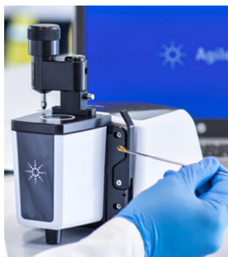
Figure 8. Spectra of cannabis concentrates and distillates were recorded without any sample preparation, using an Agilent Cary 630 FTIR spectrometer with Di ATR module.

In this study, the potency of different cannabis products by their respective THC content was determined. A Cary 630 FTIR with the diamond ATR module was used to analyze multiple cannabis sample types, such as extracts, concentrates, and distillates, with no sample preparation required. The use of the Cary 630 FTIR with the diamond ATR module offers fast and nondestructive analysis in production workflows, for example, increasing productivity and throughput in sample analysis.