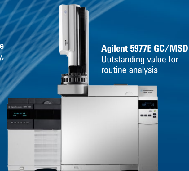
Agilent 5977E GC/MSD Outstanding value for routine analysis