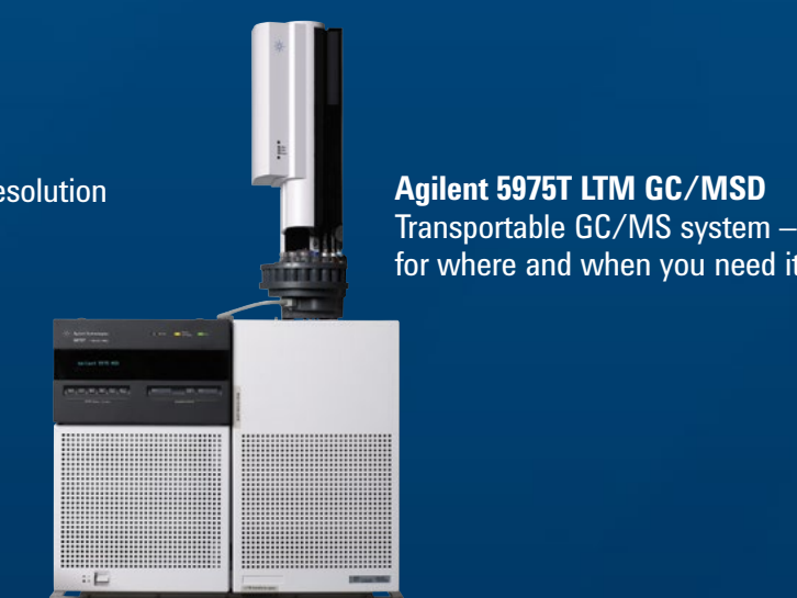
Agilent 5975T LTM GC/MSD Transportable GC/MS system – for where and when you need it