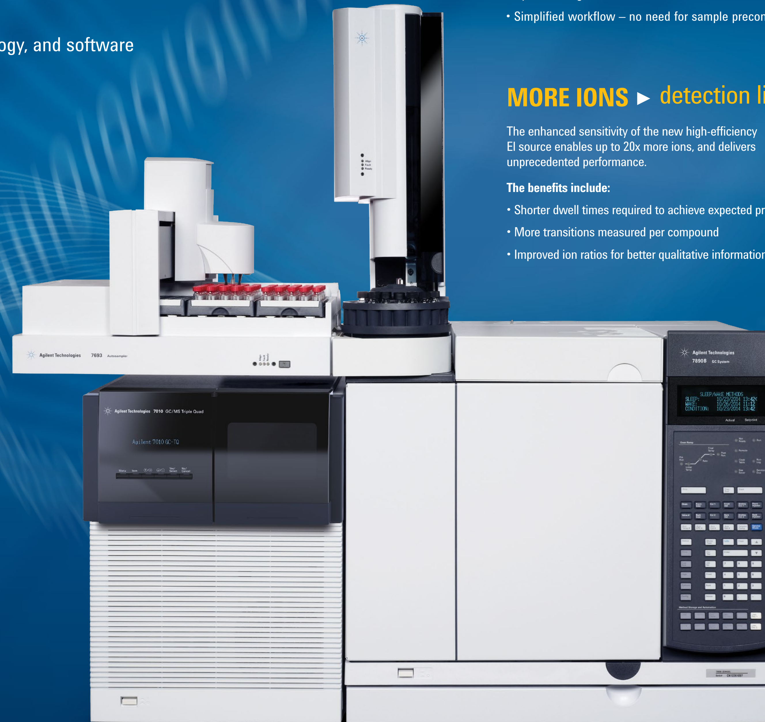
Agilent 7010 Triple Quadrupole GC/MS Setting new standards for EI performance