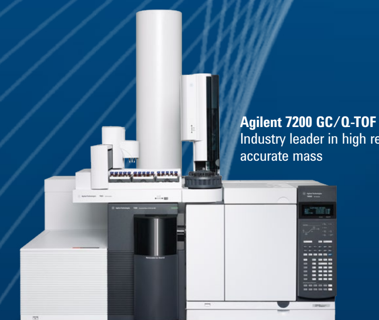
Agilent 7200 GC/Q-TOF Industry leader in high resolution accurate mass