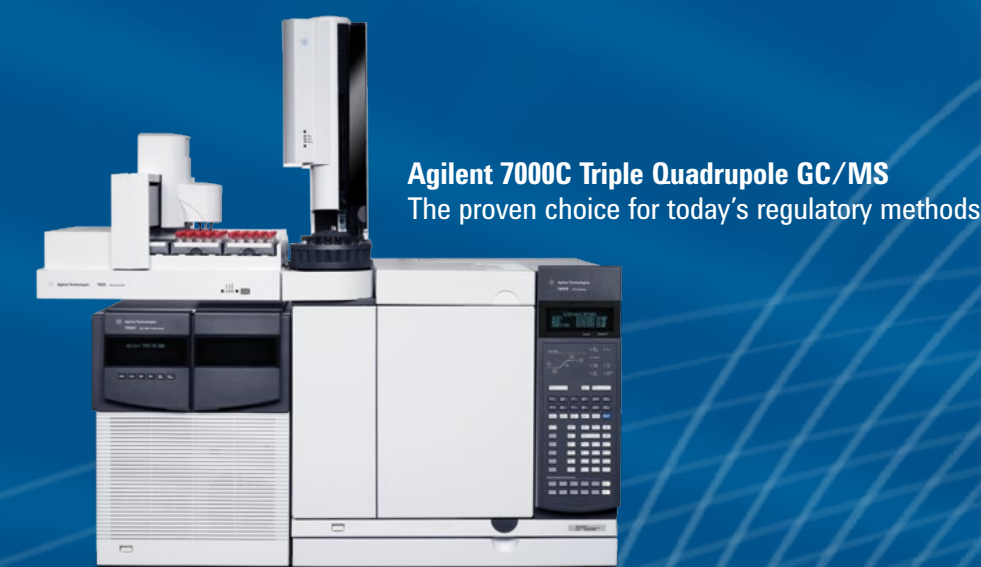
Agilent 7000C Triple Quadrupole GC/MS The proven choice for today's regulatory methods

Analysis of dioxin 2,3,7,8-TCDD (10 fg on-column) Sensitivity beyond HRMS (mag sector)