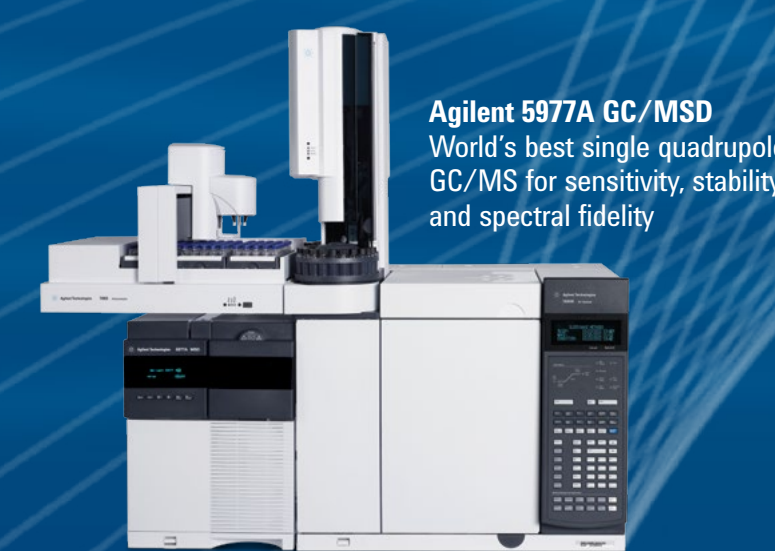
Agilent 5977A GC/MSD World's best single quadrupole GC/MS for sensitivity, stability, and spectral fidelity