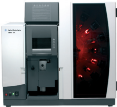
200 Series Atomic Absorption Spectrometers (AA)

Agilent offers a wide range of AAS systems including Flame and Zeeman Graphite Furnace systems. Atomic Absorption systems can play a role in the Pharmaceutical laboratory where there is a need for a quick check on higher metal content levels on a Flame system, or with a Graphite Furnace system as a lower cost alternative to ICP-MS where only a few trace metals are of interest.