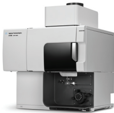
5110 SVDV Inductively Coupled Plasma Optical Emission Spectrometer (ICP-OES)

The Agilent 5110 Synchronous Vertical Dual View (SVDV) ICP-OES revolutionizes ICP-OES analysis. With its unique Dichroic Spectral Combiner (DSC) technology, you can now run axial and radial view analysis at the same time saving time and money.