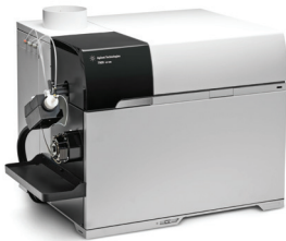
7900 ICP-MS Inductively Coupled Plasma Mass Spectrometer (ICP-MS)

The Agilent 7900 ICP-MS opens up a new dimension in ICP-MS with 10x higher matrix tolerance, 10x wider dynamic range and 10x better signal to noise than the world's bestselling Agilent 7700 ICP-MS Series.