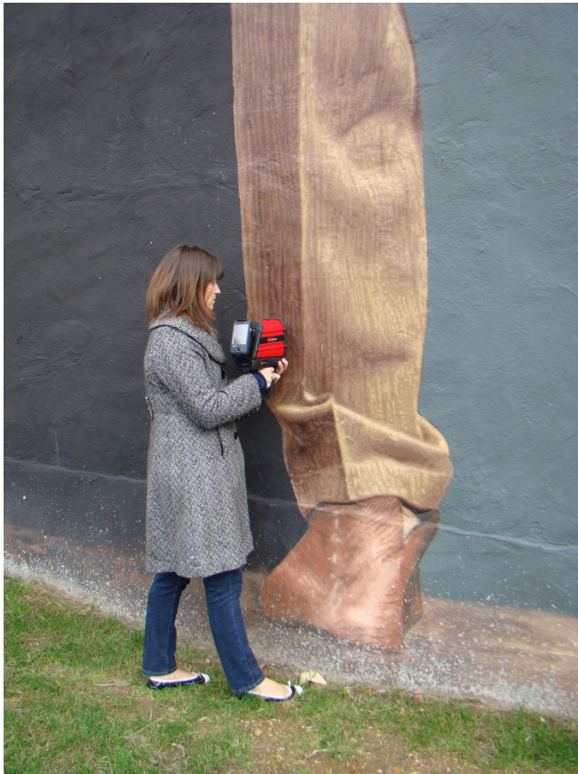
Pictured above, the 4100 ExoScan FTIR, measures delicate samples non-destructively in all types of locations.