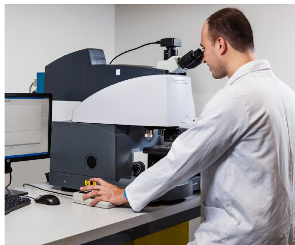
Pictured above, the Cary 620 FTIR Microscope and Imaging system can measure delicate samples in minutes of high value samples.