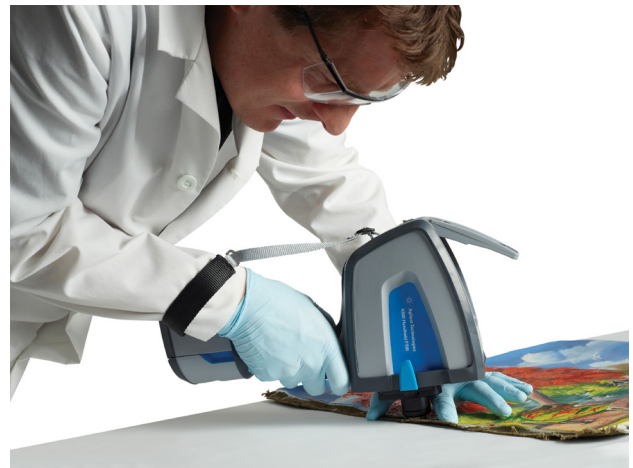
Lightweight with on-board battery power - measure in any orientation with the 4300 Handheld FTIR.