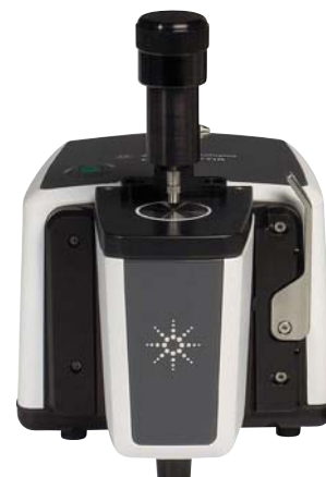
Figure 2. Agilent Cary 630 ATR-FTIR analyzer