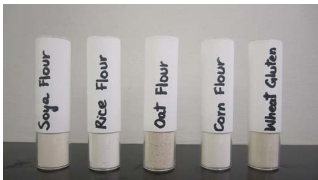
Figure 1. Various flour powders