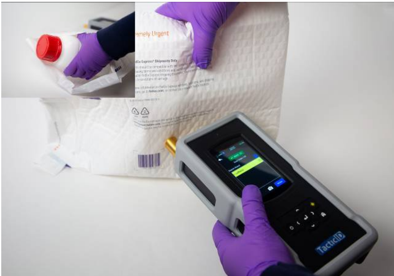
Figure 5. Measurement of white HDPE bottle of caffeine inside white padded package