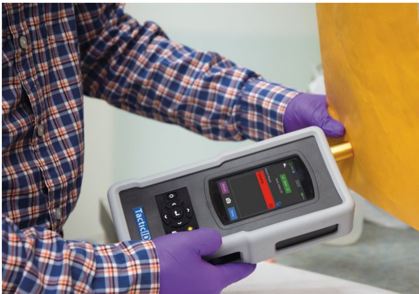
Figure 1. TacticID-1064 ST measuring a sample through a manila envelope with ST adapter

The TacticID-1064 ST is equipped with a See-Through (ST) mode scan function that allows users to identify chemicals behind thick and opaque barriers with the use of an ST sampling adapter ( Figure 1 ). A hit quality index (HQI) is used to match the unknown sample to a library spectrum. The HQI calculation ranges from 100 (best match) to 0 (worst match). The system employs an automatic integration time. The laser power is adjustable, but was set to 90% for these measurements. The number of hits can also be adjusted.