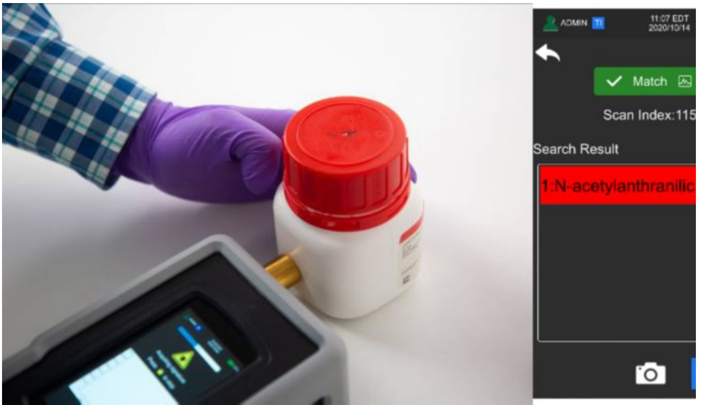
Figure 4. TacticID-1064 ST measurement through HDPE bottle and match result for N-acetylanthranilic acid

Caffeine in a white plastic bottle was placed inside a white padded shipping package for analysis ( Figure 5 ). In this case, the caffeine must be identified through both the plastic and the padded package. The ST mode on the TacticID-1064 ST was able to successfully identify the caffeine through the padded package and plastic bottle with an HQI of 91.3.