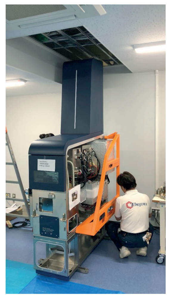
First instrument in Japan (May, 2018): The Japanese room is not high enough for the tall German timsTOF Pro