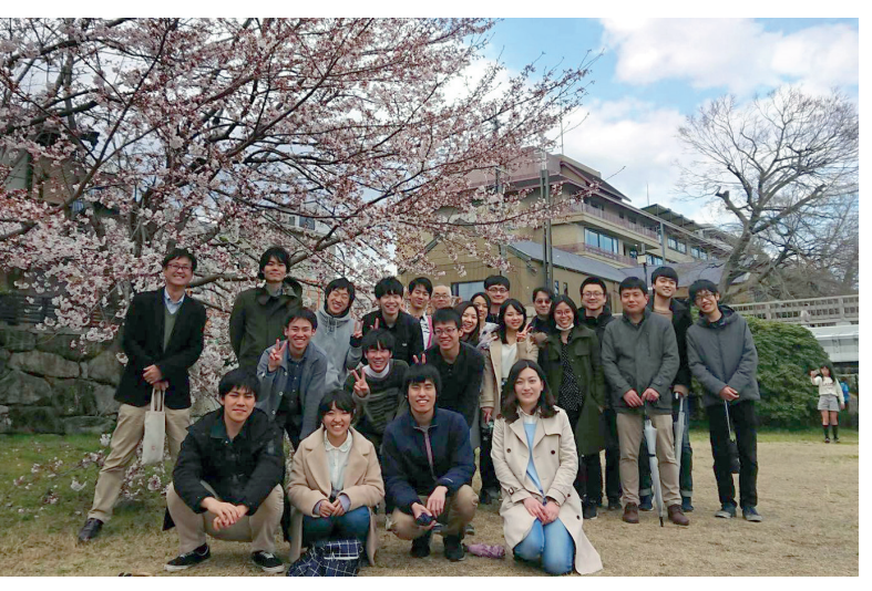
Four new members join the MCBA laboratory in April 2019

"I worked in a pharmaceutical company for 14 years after I completed my studies. I then moved back to academia in 2006, at a time when proteomics was just emerging, so it was a great time to enter the field. There have been many technological improvements and developments, but still new technology is needed to drive the field. That's where my background in analytical chemistry is useful and can be applied to life science."