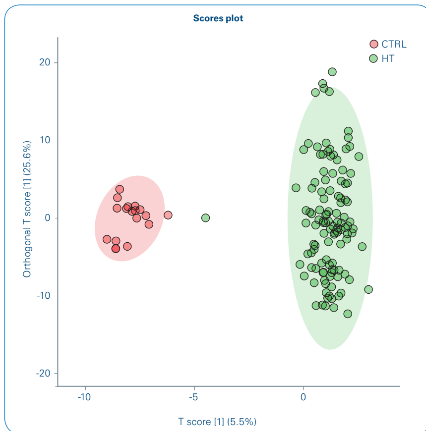
Figure 2: PLS-DA statistical plot (red: control, green: hypertensive)

Total lipid extracts from 33 human plasma samples were analysed in this study. The analysis of plasma lipid extracts showed a very complex profile. Roughly 200 lipids (considering both positive and negative ionization) were putatively annotated, with very good mass accuracy (average error \leq 0.1 ppm) and detected lipids belonging to different classes. Among them, as shown in Figure 1, different sphingolipids showed alteration between healthy and hypertensive subjects (patients). This is shown in Figure 1 reporting the fold change of mainly sphingolipids. Both groups, healthy and hypertensive, could be clearly separated in the statistic